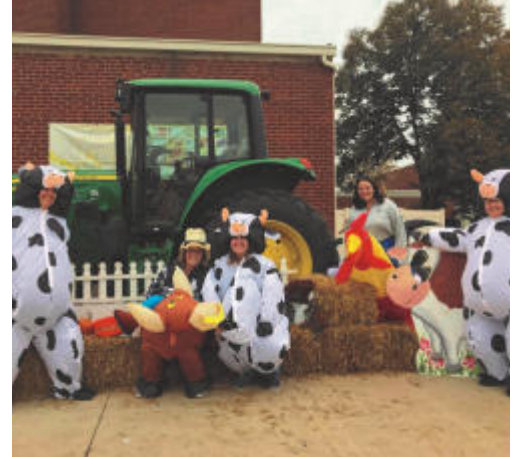
X A V I E R T R U N K - O R - T R E A T