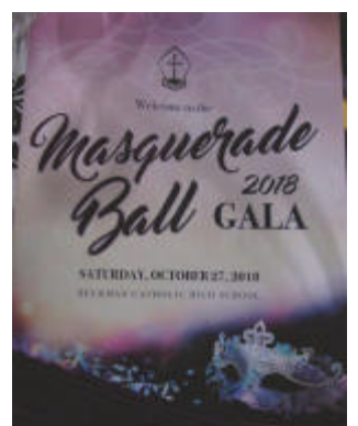
B E C K M A N C A T H O L I C G A L A