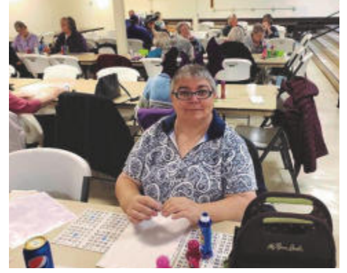
H A L L O W E E N N I G H T A T B I N G O